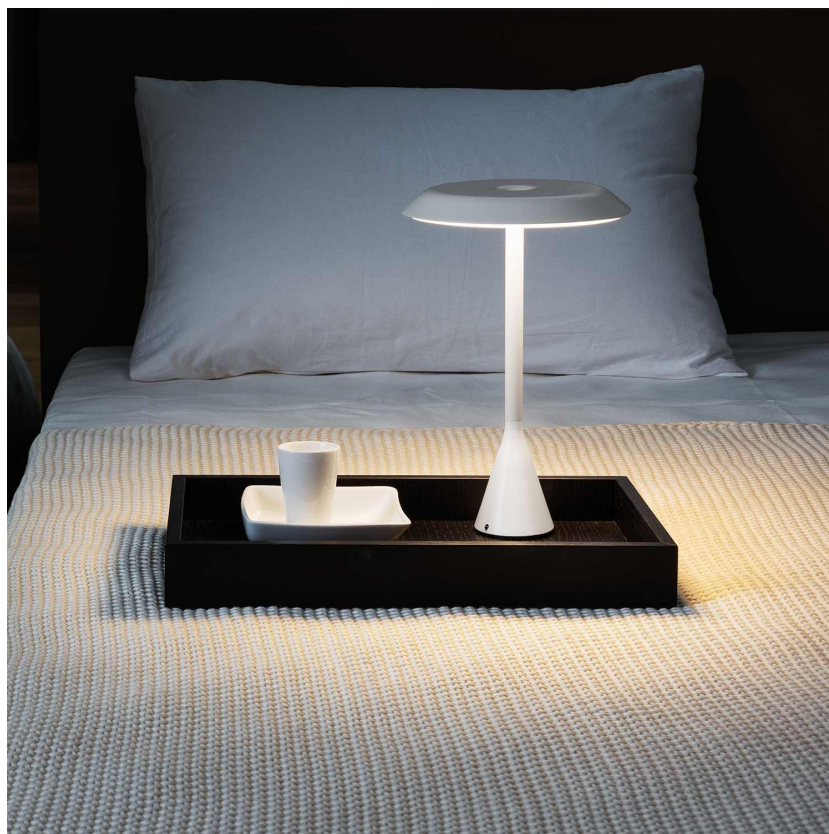
Table lamp with LED sources for a widespread lighting, suitable for domestic and working places. Aluminium structure, polycarbonate diffuser with anti-glare treatment. Available in two versions: Panama and Panama Mini, white or black. Mini available also in the cordless portable rechargeable version. Duration: 7 hours, recharge: 3,5 hours.